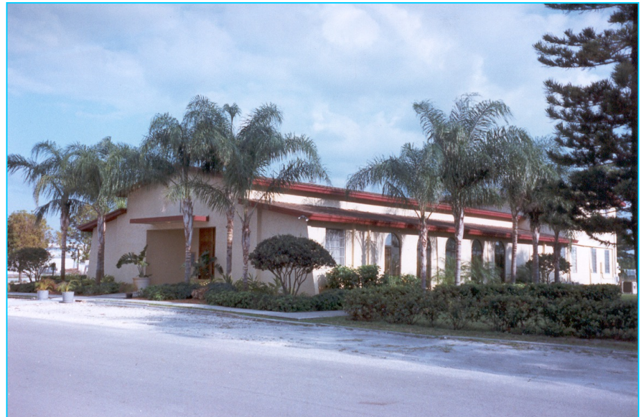
SW 27th Street