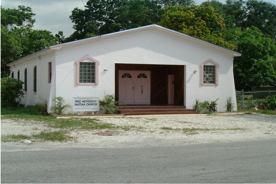
SW 2nd Court in Sailboat Bend