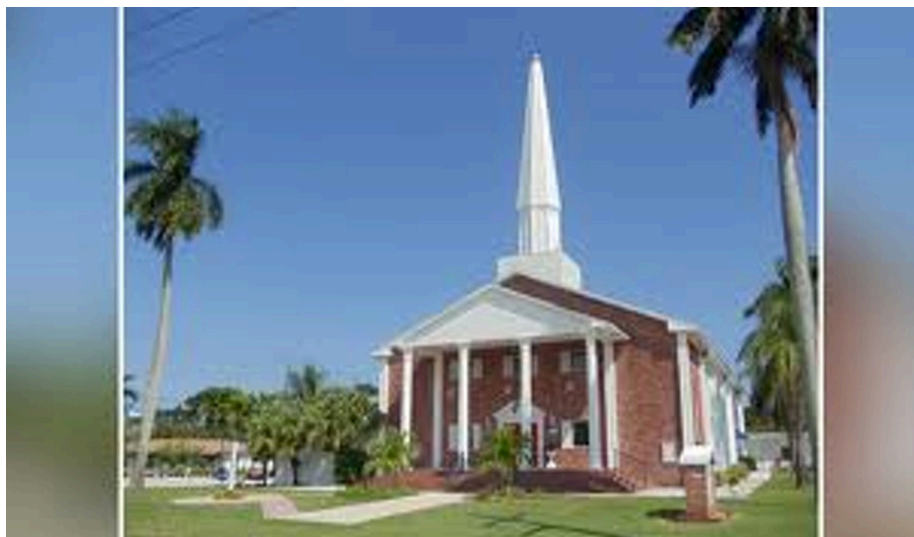
1480 SW 9th Ave